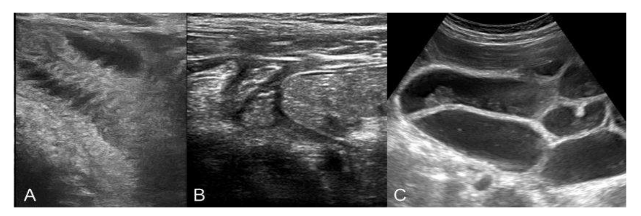
Fig. 1: The sonographic sign of bowel obstruction: A) Visibility of valvulae conniventes as a stack of coin. B) Transit point of obstruction as dilatation and collapse of affected loop due to adhesion. C) Fluid-filled and sausage-shaped dilatation of loops.

done assessing for the presence of the following views/signs: fluid-filled dilated loops, collapsed loops, the transition point the dilated proximal between collapsed distal loops, tubular or sausageshaped dilatation of bowels, valvulae conniventes (stack of coins view), to-andfro motion of the bowel contents, and the cause of the obstruction at the transition (Fig. 1). Other nonspecific ultrasound signs are peritoneal free fluid, bowel wall thickening, and intra-mural gas.