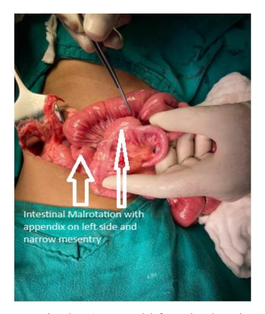
Fig. 1: Exploratory laparotomy in the 5-year-old female showing appendix on the left with narrow DJ mesentery with malrotation of gut

distension of bowel loops; 2. Clockwise rotated bowel along its axis with an appendix on the left side; 3. Narrow mesentery; 4. Polysplenia; 5. Suggestive of Intestinal malrotation with mid-gut volvulus, Ladd's procedure was done without appendectomy ( Fig. 2 ). The child recovered well.