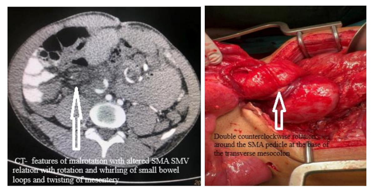
Fig. 3: 13-year-old male with CT suggestive of rotation of the Superior mesenteric Vein along with whirling of small bowel loop and operative finding of double counterclockwise rotation around the SMA pedicle at the base of the transverse mesocolon.

confirmed when a contrast-enhanced CT was obtained which demonstrated features of malrotation, i.e., SMV was seen encircling and rotated around SMA associated with rotation and whirlpooling of small bowel loops and twisting of mesentery with prominent proximal bowel loops. The patient was taken up for exploratory laparotomy. Intraoperative findings showed the small bowel on the right side of the abdomen. The caecum and ascending colon were present in the midline. The duodenal loop was found making a double counterclockwise rotation around the SMA pedicle at the base of the transverse mesocolon. Also, a jejunal loop making another double was counterclockwise rotation around a band at the ileocolic junction. Ladd's procedure was performed with appendicectomy and widening of the mesentery (Fig. 3).