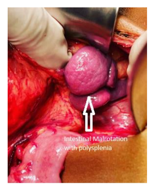
Fig. 2: Ladd's procedure is being done in the 4-year-old male child showing a distended bowel with rotated bowel with left side appendix with Polysplenia.