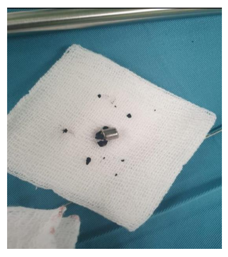
Fig.3 : Foreign body (screw) which was removed from the bronchus.

patient was treated in the Pediatric Intensive Care Unit. On the fifteenth day of care the child was declared eligible to go home with an improvement of condition ( Figure.4 ). The patient was the second child of the family. He came from a sundanese family, considered as low income family, and the parents were high school graduates.