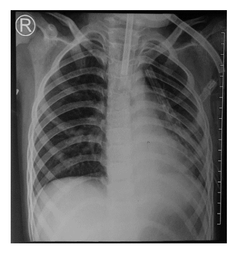
Fig.4 : Thorax X-ray (anteroposterior view) after bronchoscopy and thoracotomy.