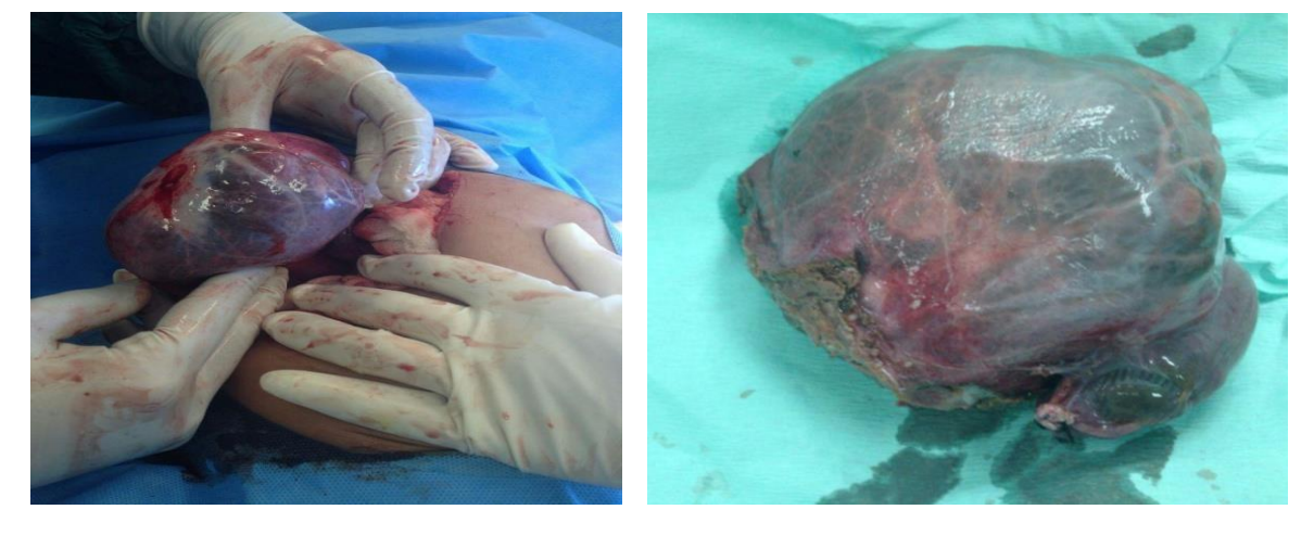
Fig.2: Remove tumor of liver with lobectomy surgery.