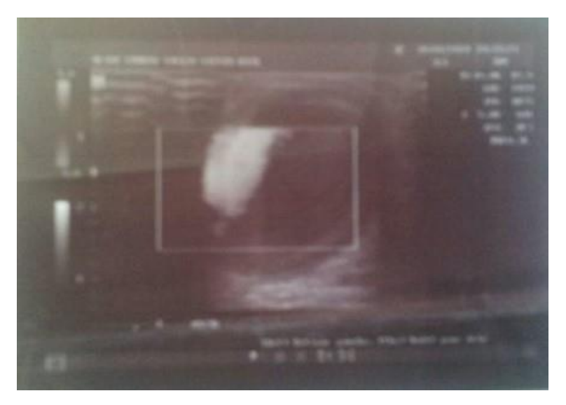
Fig.2: Duplex ultrasound of the False Aneurysm.