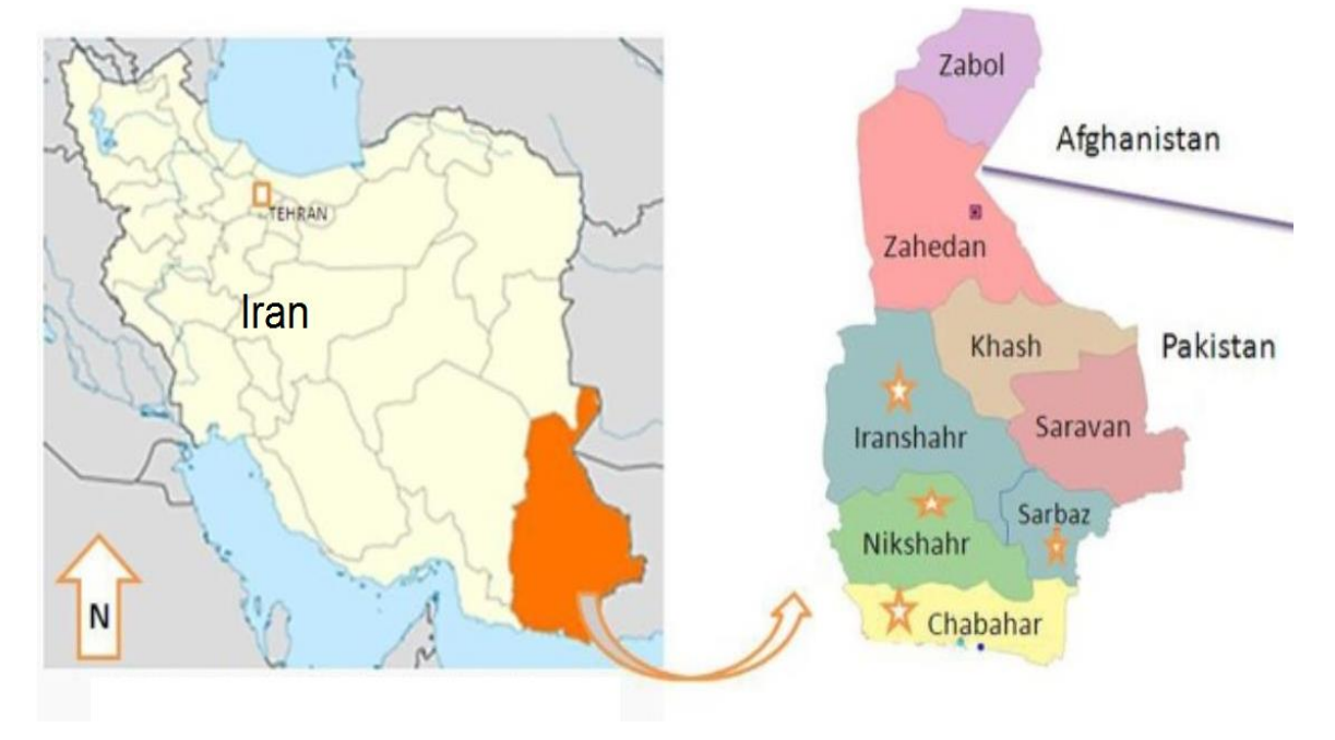
Fig.1: Location of Sistan and Baluchistan Province in Iran

variables using Fisher's exact test and Chisquare test. Data were analyzed using SPSS version 18 software. P \le 0.05 was considered as significant level of the tests.