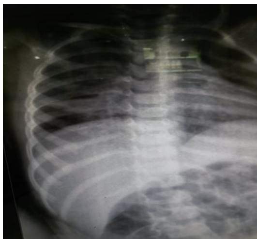
Fig. 3: After bronchoscopy and removing the FB