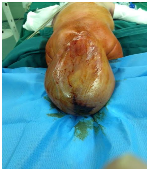
Fig.3: Tumoral lesion with dimensions of 8 x 6 x 9 cm.