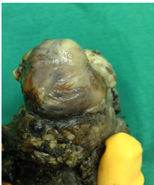
Fig.1: Sacral area mass measuring of 12.5 \times 8.5 cm.

FIF was diagnosed for the infant ( Figure.2 ). After the final diagnosis was performed by the pediatric surgeon, the patient was prepared for surgery under general anesthesia. The two day old infant was underwent surgery and the cyst was discarded. After transverse incision of the thick skin of the cyst, a tumor lesion with dimensions of 8 \times 6 \times 9 cm was observed ( Figures 3, 4 ). The patient was discharged 48 hours after surgery with a good general appearance. No problem was reported in the 6 month follow up of the patient.