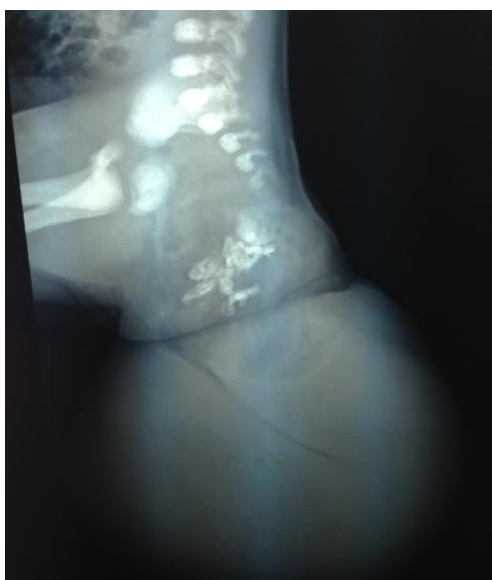
Fig.2: Post-birth graph of the Sacrum mass.