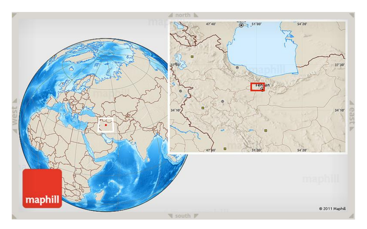
Fig1: Physical Map of Karaj city, Alborz province, Iran.

history of diseases such as liver, kidney, thyroid, gestational diabetes, type 2 diabetes, hypertension, metabolic bone disease and history of drug use.