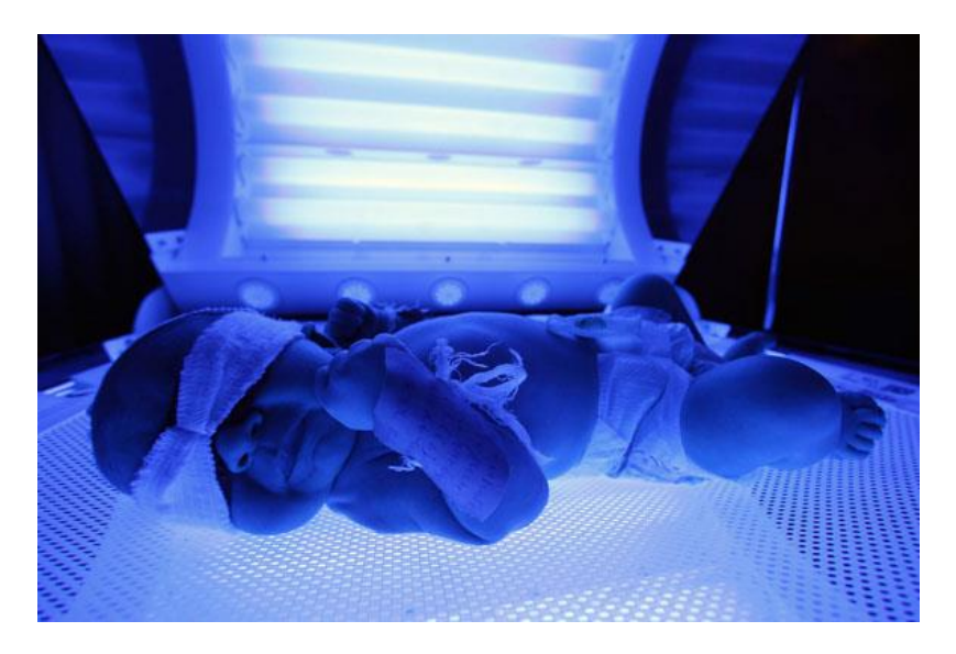
Fig1 : Phototherapy in neonates.

related to exchange Complications transfusion included: hypocalcemia (serum calcium concentration less than 8 mg/dl in term infants and less than 7 mg /dl in preterm infants), hyperkalemia (serum potassium concentration greater than 5.5 mmol/L), hypoglycemia (plasma glucose concentration less than 40 mg/dl), 150,000 thrombocytopenia (less than platelet counts), sepsis (clinical signs of infection + positive blood culture), necrotizing enterocolitis (including abdominal distention and radiographic symptoms), cardiac arrhythmias and eventually death.