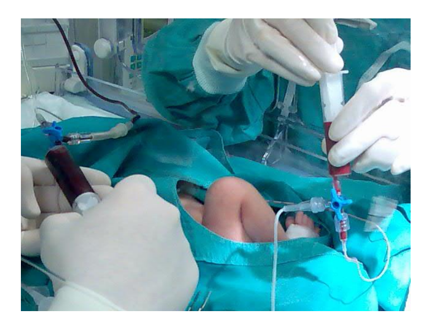
Fig.2: Exchange transfusion in neonates.