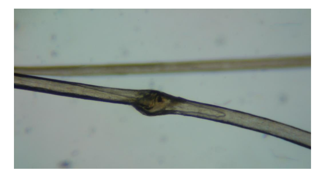
Fig.1 : The bamboo shape Hair shaft anomaly in Netherton syndrome with light microscopy examination (case.1).

normal range. Examination his hair under light microscopy revealed trichorrhexis invagina, highly suggestive for Netherton syndrome ( Figure.2 ). Starting corticosteroid with doses 2mg/kg/day resulted to improvement of disease. After two weeks prednisolone, tapered to 0.2mg/kg every other day and continued for three months, and then discontinued. The response to the treatment was excellent.