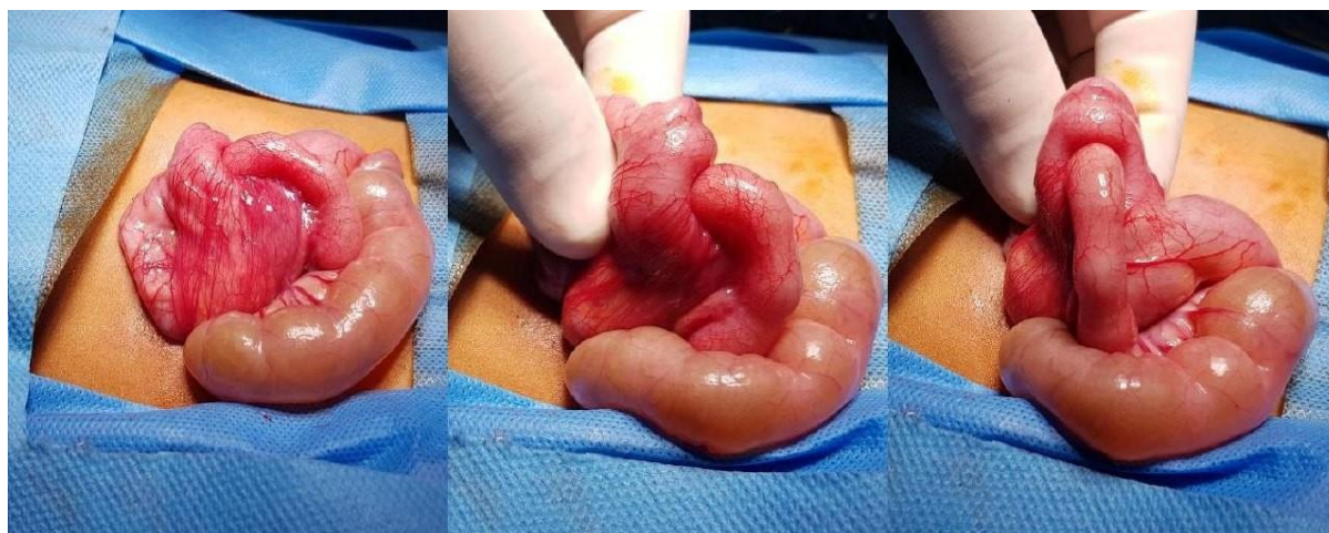
Fig.2: Surgery images shows invagination of vermiform appendix into cecum.

lymphoid hyperplasia was observed in vermiform appendix. After recovering from clinical symptoms, the patient was discharged in good general condition.