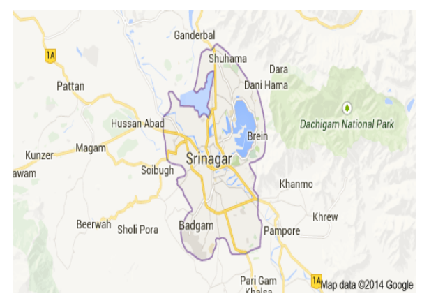
Fig.1: Study area

Probable bacteremia was defined as the growth of two or more types of bacteria (19). Definite bacterial meningitis was defined as isolation of organism on Cerebrospinal fluid (CSF) culture. Probable bacterial meningitis was defined as abnormal CSF on analysis with sterile CSF culture. Only patient with definite bacterial infection was taken as serious bacterial infection.