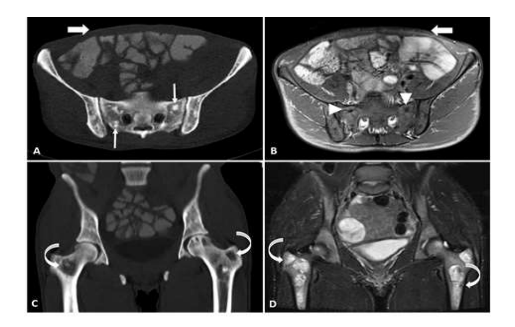
Fig.2 : Imaging findings of the patient. Sclerotic bony lesions (arrows) in axial CT scan (A) with corresponding hypointense foci (arrow heads) in T1-weighted MRI (B) of the pelvis. Considerable loss of subcutaneous fat is also noted (thick arrows). There are well-defined cystic appearing lytic lesions in coronal CT scan (C) and T2-weighted MRI (D) of proximal femurs (curved arrows).

FBS: Fasting blood sugar; AST: Aspartate Aminotransferase; ALT: Alanine Aminotransferase; IGF1: Insulinlike growth factor 1; GH: Growth Hormone; T4: Thyroxine; TSH: Thyroid-Stimulating Hormone.