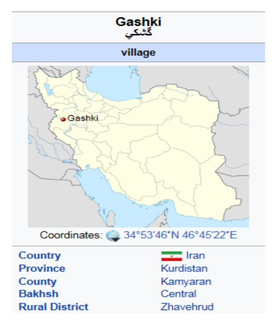
Fig.1: The location of Gashki, Kamyaran County, Kurdistan Province, Iran.