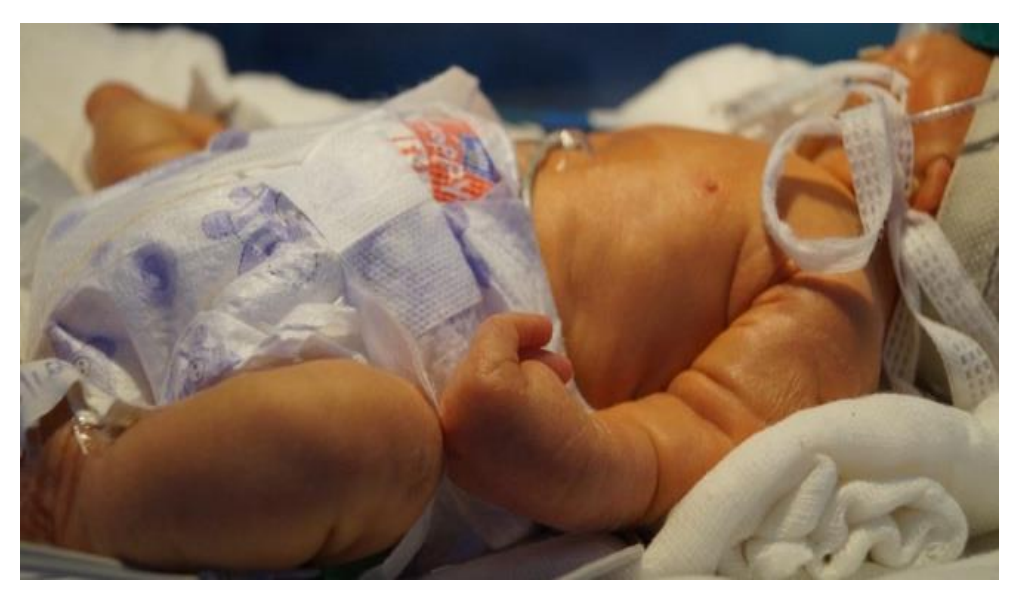
Fig. 1A: Excessive skin folds.

non-consanguineous marriage to a 21 years old gravida 2 mother by emergency caesarian section at 36 weeks in view of absent end diastolic flow of umbilical artery. There was history of one abortion earlier. There was no family history of skeletal anomalies. The neonate did not cry at birth, but color and cry improved with stimulation. He required non-invasive ventilation in view of moderate respiratory distress. On examination, neonate weighed 1,700gr with length of 37cm, head circumference of 33cm, and upper segment lower segment ratio of 2.08. There was facial dysmorphism, gum hypertrophy, heterochromia iridis albinism. and excessive skin folds (Figure. 1A).