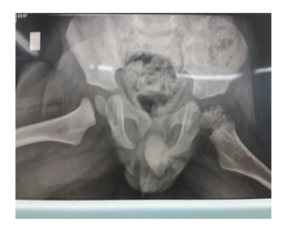
Fig.3 : Follow-up X-ray pelvis anteroposterior.