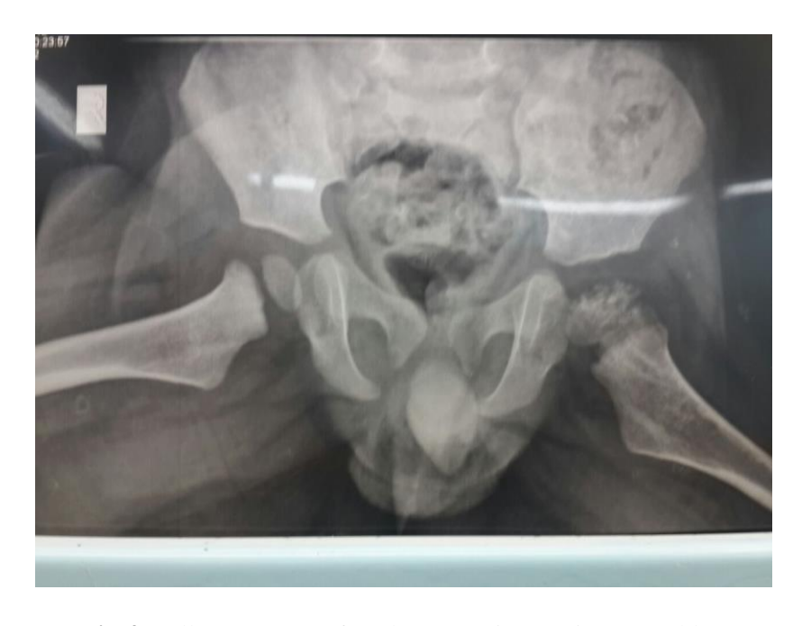
Fig.4 : Follow-up X-ray frog-leg (containment is acceptable).