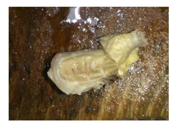
Fig.1: Macroscopic picture of carcinoid tumor in present patient (hematoxylin and eosin, ×400).

A 13-year-old female presented with abdominal pain in the right lower quadrant (RLQ), with nausea and decreased appetite for the previous 2 days. A physical examination favored a diagnosis of acute appendicitis. The patient underwent an emergency appendectomy. On the tip of the appendix, a firm yellowish mass with a diameter of 0.8 cm was identified (Figure. 1). The histological examination revealed a carcinoid tumor composed of solid nests islets. Mitotic activity insignificant. The tumor involved the muscular layer and extended to the overlying serosal surface. The tumor did not extend to the base of the appendix. Figure.2 shows aphotomicrograph of a typical appendiceal carcinoid tumor (Hematoxylin and Eosin. 40\times ), characterized by solid nests (islands) containing a uniform population of round to oval cells. In the present case, the cells had scant eosinophilic cytoplasm, with fine nuclear chromatin. Mitosis was rare (Figure. 3). The tumor cells invaded the muscularis layer and serosa.