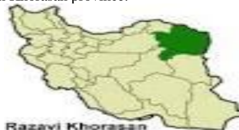
Fig 2: Khorasan Razavi province location on Iran's map

Mashhad 2 with 336 covered and 116 children with thalassemia major types. Mashhad 3 with 166 covered and 53 children with thalassemia major types. Mashhad 1 with 160 covered and 47 children with thalassemia major types. And overall Thalassemia prevalence is 0.6% in Khorasan province.