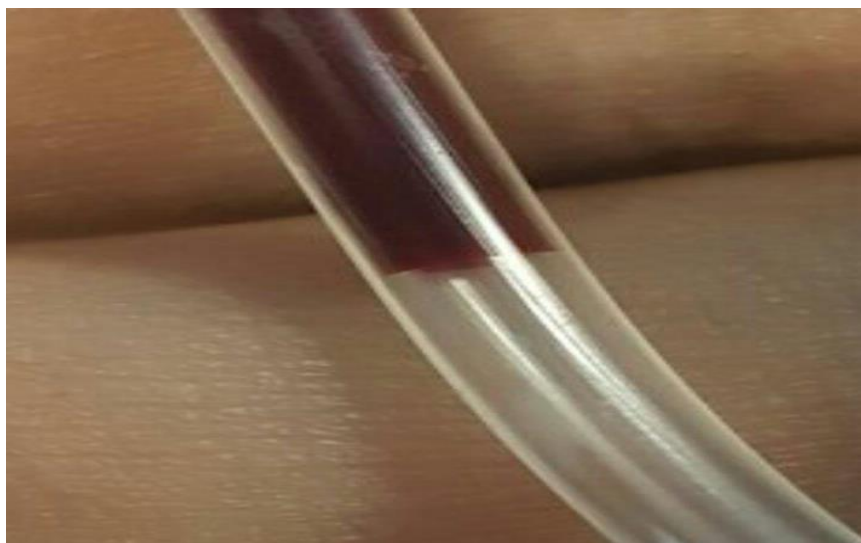
Fig.2: Negative rat tail sign. It means that the tip of catheter is not in the vessel and is on other place such as plural and pericardium.