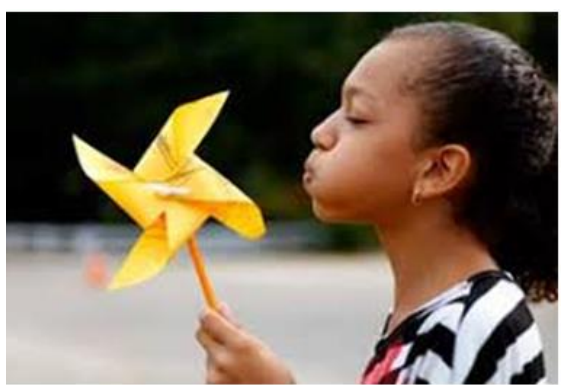
Fig.1 : Deep breathing with blowing paper whirligigs.

during exhalation, after spinning whirligig and exhalation, numbers were counted up to 10 spins ( Picture.1 ). In group 2 (deep breathing), inhalation was by nose and exhalation by mouth, after exhalation, numbers were counted up to 10 breaths. The venipuncture was performed before the counting was completed. In the control group, no intervention was performed. In each of the three groups, 3 minutes after venipuncture, the researcher asked the child about the intensity of pain, using Oucher self-report scale, instrument, and recorded the results in the (16).