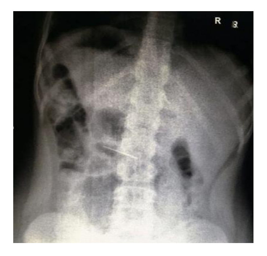
Fig.2: Abdominal X-ray showing the needle had passed the pylorus.