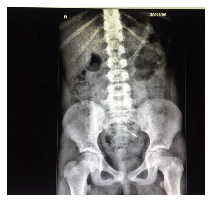
Fig.3 : Follow up abdominal X-ray after 24 h revealed that the needle passed the small intestine and was in the colon.