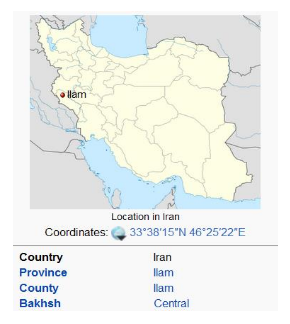
Fig.1: The location of Ilam city, Iran

The present research was a quasiexperimental intervention study using the pretest-posttest method. The statistical population included all male high school students in Ilam city, in the academic year 2015 to 2016.