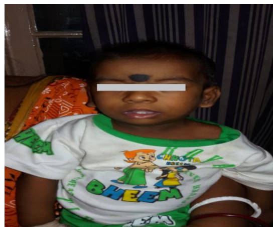
Fig 1: Atypical Facial Features

ruled out. After excluding all the common possibilities we did a karyotyping and there was deletion of a part of chromosome 5 (Figure.2).