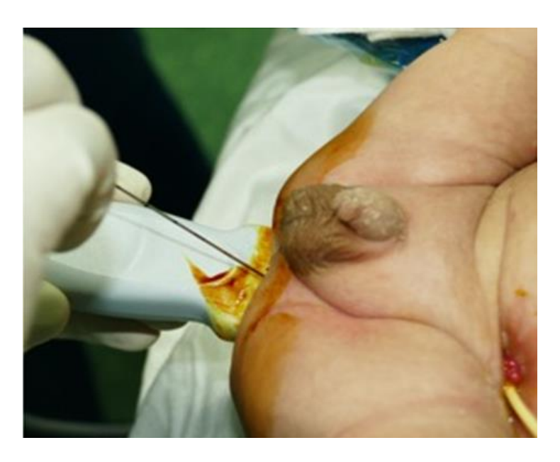
Fig.1 : Insertion of a needle and guidewire through the center of external anal sphincter muscle complex under sonography guidance. Normal saline is injected into the rectal pouch via a Foley catheter inserted in distal limb of colostomy.

were conducted by the resident of pediatric surgery, a sonographer and a pediatric surgeon. Data presented as median and range. Data were analyzed using SPSS for windows (version 21.0, SPSS Inc., Chicago, IL. USA). Frequencies, percentage, mean and standard deviation (SD) were determined.