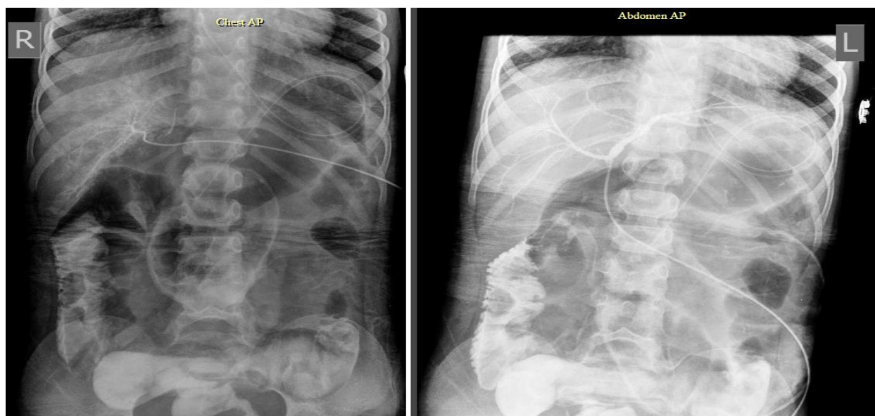
Fig.2: Cholangiography during the reoperation.